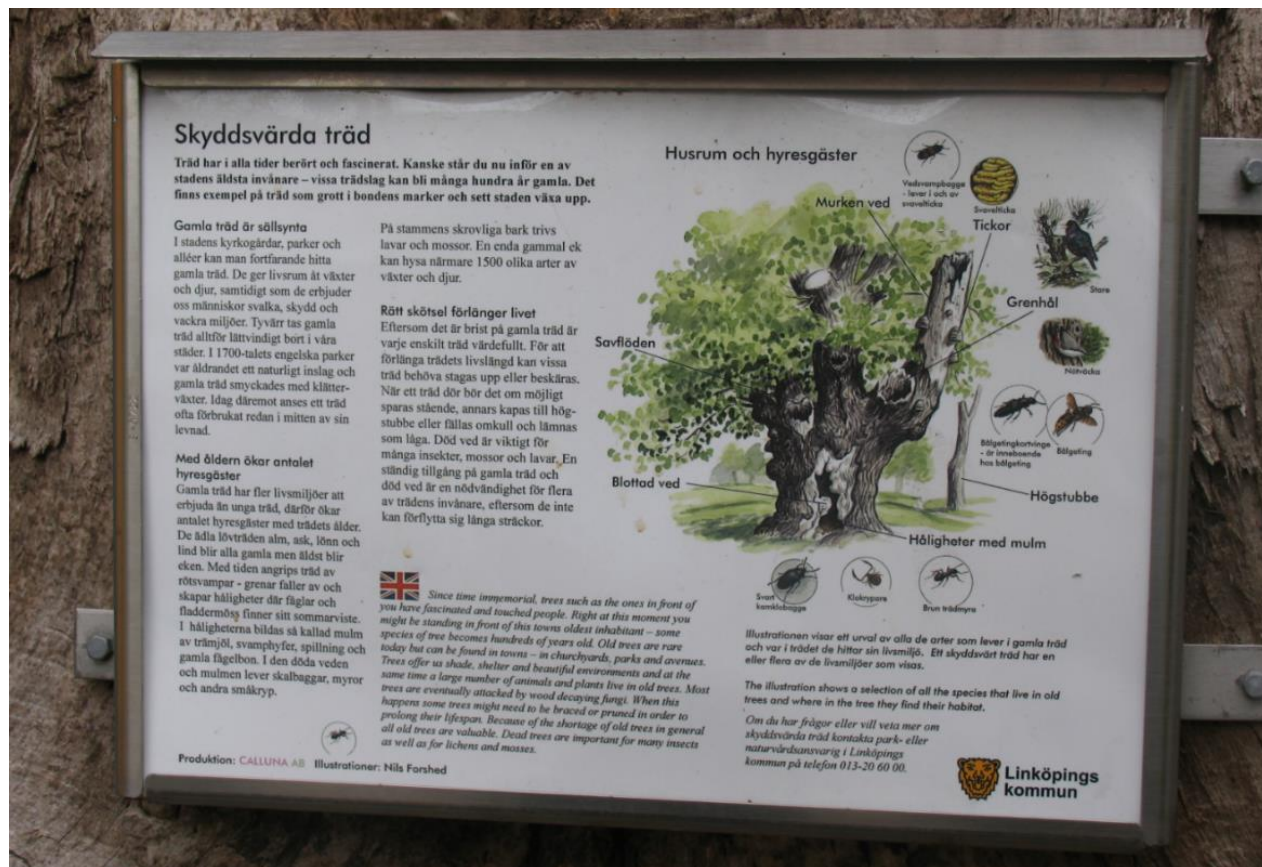
Figure 2. Examples of stands.